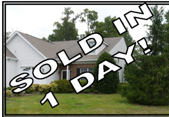
4301 Turnberry Drive $235,000