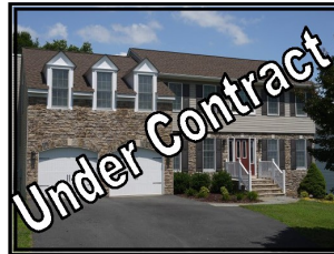
10313 Augusta Court $354,900