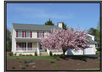
4109 Amelia Drive $319,900