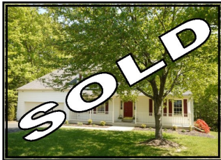
4311 Prestwoud Court $352,500